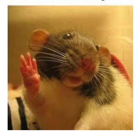
Oh Hi! My name is Sam, and I'll be your rodent for this evening.